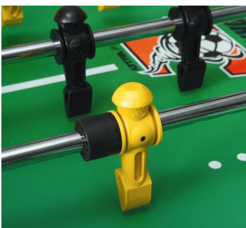
Figure 3 is an old Dynamo Handle-side split bearing, part # 860120125. It has not been used in production for a number of years, and will be available only while supplies last.

Figure 2 is a 1½" snap-in bearing, part # 20515992. It is used on the Tornado Classic and Dynamo Big D, and MAY fit older tables with a 1½" sidewall that use a snap-in bearing.